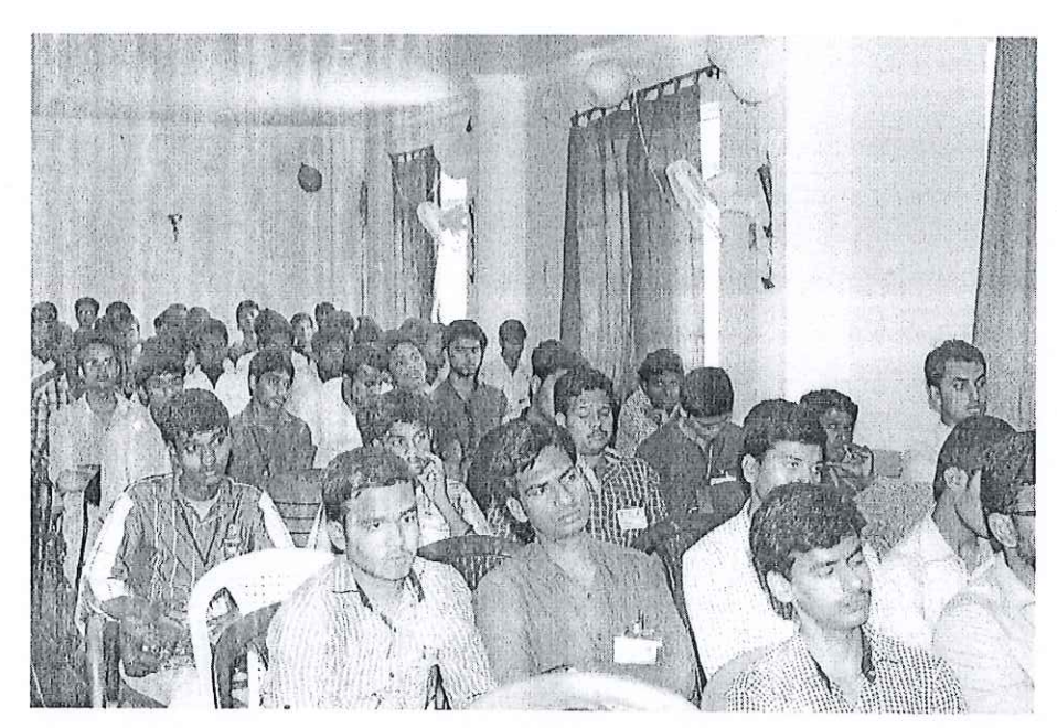
Students @ CRT Programming class

The department of CRT conducted classes on Technical for III and IV B.Tech students at Mother Theresa Institute of Engineering and Technology for Semester –I, 2019 – 2020. It is a unique programme and the objective of it is to prepare students to come out successfully in the campus Interviews. Companies meticulously test the students in their technical abilities. The institute feels preparing students in the above areas can't be done in a short duration. Therefore CRT classes are conducted till the students get their jobs.