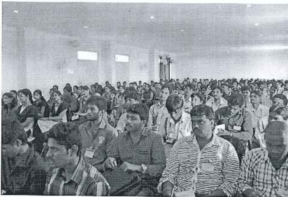
Students @ quantitative aptitude class

The department of CRT conducted classes on Quantitative Aptitude for III and IV B.Tech students at Mother Theresa Institute of Engineering and Technology for Semester – I, 2019 – 2020. It is a unique programme and the objective of it is to prepare students to come out successfully in the campus Interviews. Companies meticulously test the students in their Quantitative Aptitude abilities. The institute feels preparing students in the above areas can't be done in a short duration. Therefore CRT classes are conducted till the students get their jobs.